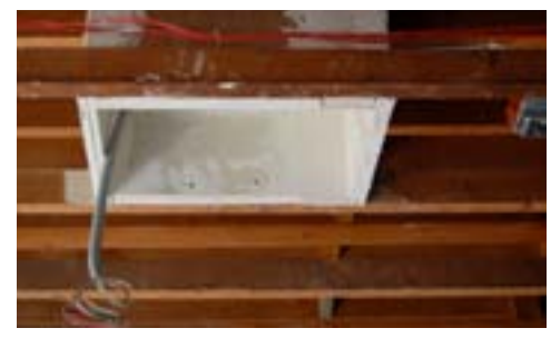
One of the 38 recessed lighting boxes